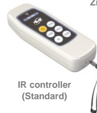
IR controller (Standard)